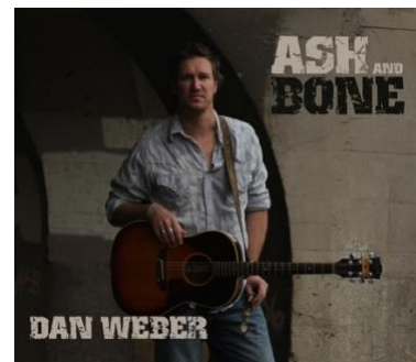
Ash and Bone - 2012