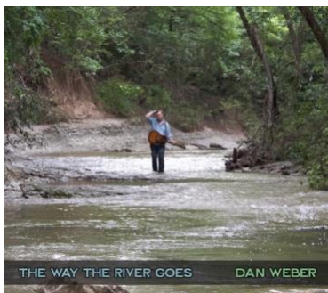
The Way the River Goes - 2020